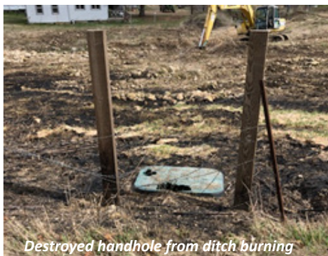
Destroyed handhole from ditch burning