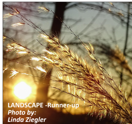
LANDSCAPE -Runner-up

The 2021 VC Co-op "Heart of the Driftless" Photo Contest brought an astounding number of local photographers to light by presenting their photos to the contest. The contest presents photos of what Rural Living means and the categories were: Events, People, and Landscape . There were many beautiful photos that depict the wholesome, beautiful area we live in. The selection was not an easy choice.