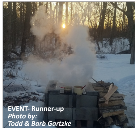
EVENT- Runner-up