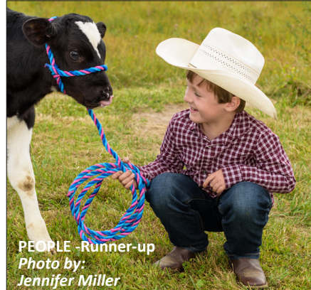
PEOPLE -Runner-up