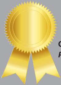
PHOTO CONTEST WINNERS