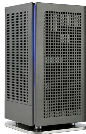
Calix Gigaspire High-performance router

To recap, the general rule of thumb is to select a centrally located spot away from any walls and other electronics. If you are having issues despite having a centrally located Wi-Fi router, you may need a new router or additional Access Points.