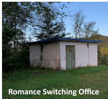
Romance Switching Office