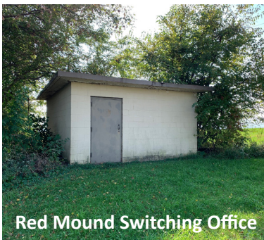
Red Mound Switching Office

Imagine a map of the county and every little burg or ridge having a separate telephone company. In the late 1950's, most were run out of a switchboard in the local grocery store or other business. History repeats itself. We are seeing consolidation as the only way to lower overheads and keep up with new technology costs. Higher expenses and smaller margins need to be made by adding more units. The big guys are abandoning low density areas, just as they did in past. We are trying to pick up some of those areas by using grants and loans to grow the cooperative and not leave those customers behind, just like we did 60-70 years ago. History is once again repeating itself!