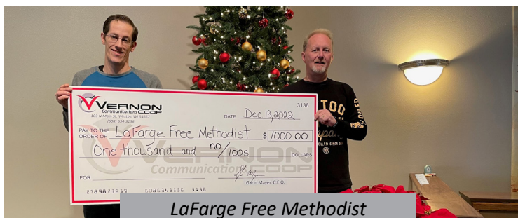
LaFarge Free Methodist