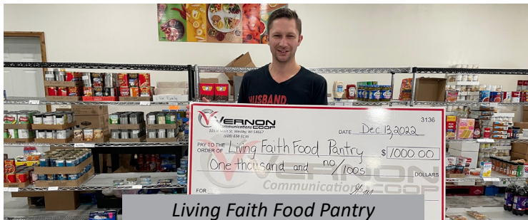
Living Faith Food Pantry