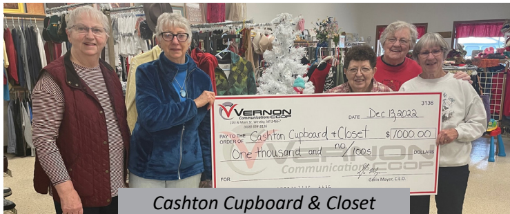
Cashton Cupboard & Closet

One of the 7 principles of a cooperative is giving back to the communities they serve and is part of VC Co-op's mission. Giving back is what makes our work truly meaningful and supports our objective. Food pantry donations have been a part of our annual giving for many years and makes an impact on the communities we serve. In December, 6 food pantry's (Cashton Cupboard and Closet, Bethel Butikk, La Farge Free Methodist, Living Faith Food Pantry, New Hope Food Pantry (Missing from photo), and Viola Methodist Food Pantry) were given $1000.00 each to support their cause.