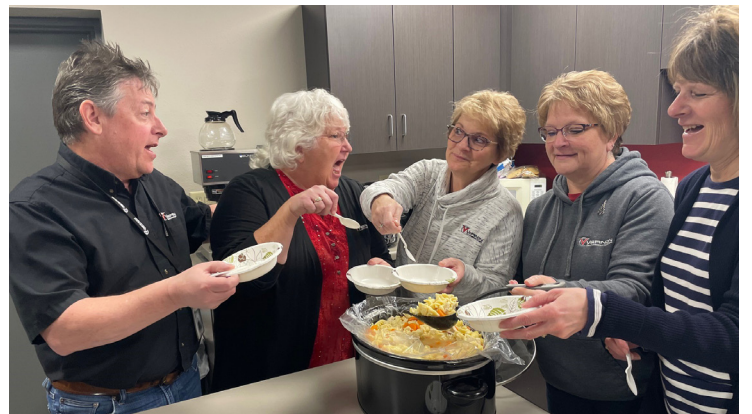
VC Co-op Employee Soup Lunch

A soup lunch not only benefitted our employees, but the Salvation Army received a donation at Christmas. Several employees made soup on Wednesday, December 14th and any employee that reaped the benefits of the soup donated money towards the lunch. The donation was given to the Salvation Army for their annual Christmas drive.