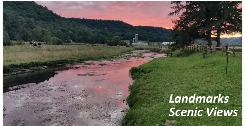
Landmarks Scenic Views