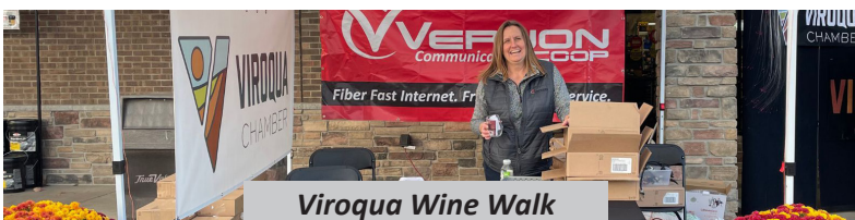
Viroqua Wine Walk

As we stand on the cusp of a brand new year, January's promise of new beginnings feels especially charged after a year like 2023. It was a year where our commitment to our local communities unfolded with construction in Crawford and Monroe counties. This has fueled our passion for economic development as we enter into 2024 brimming with enthusiasm. We have exciting initiatives on the pipeline, aimed at fostering growth and prosperity in the areas we serve. Monroe County will be the focus for construction beginning in the spring. As changes evolve we will continue to do what is right for our great cooperative. Let's make 2024 a year to remember!!