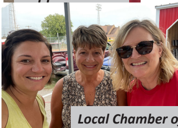
Local Chamber of Commerce Events