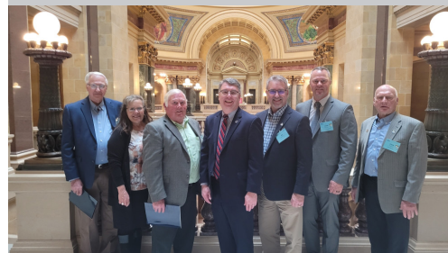
Advocates for Broadband