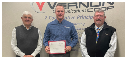
Supporting our local Schools