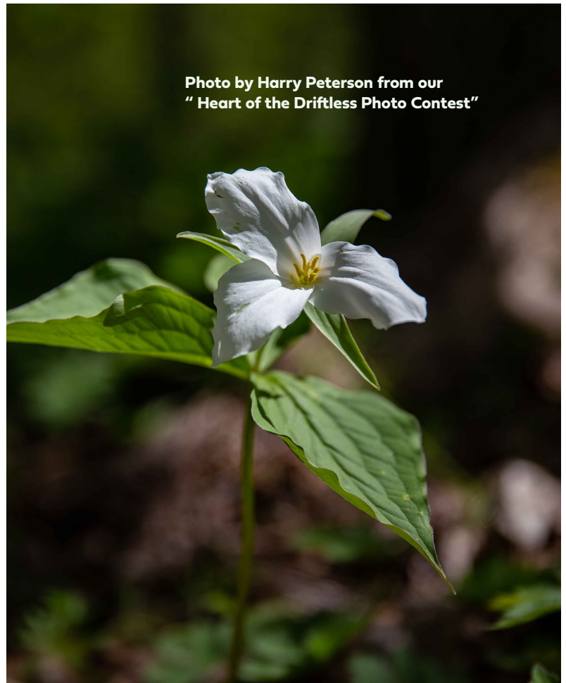
from our "Heart of the Driftless Photo Contest"

Empower Progress - We know our members deserve the best communications solutions that open doors of possibility. We're here to empower our members to be change makers, creators and entrepreneurs by providing fast, reliable services. At our cooperative progress isn't just a fancy word. Progress means we're constantly asking "why" and "what if", because we believe in pushing boundaries that make things better for our members, our community and each other.