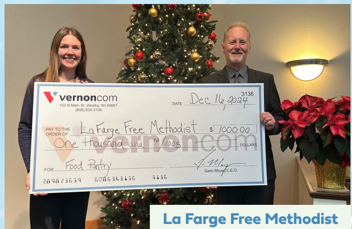
La Farge Free Methodist