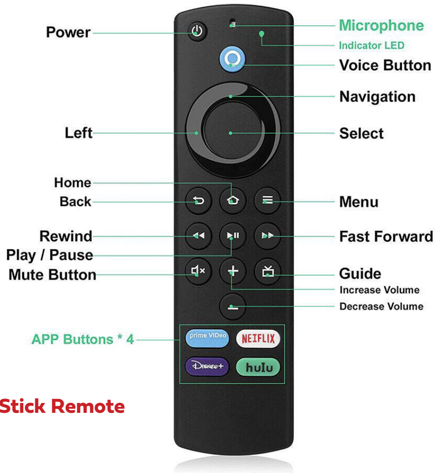
Fire TV Stick Remote